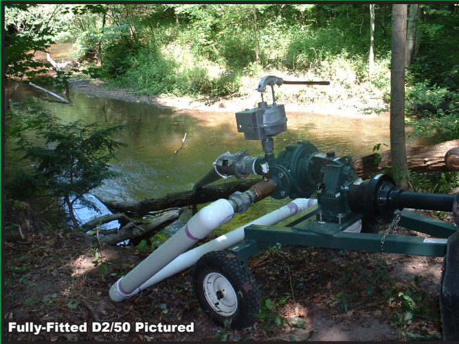
Fully-Fitted D2/50 Pictured