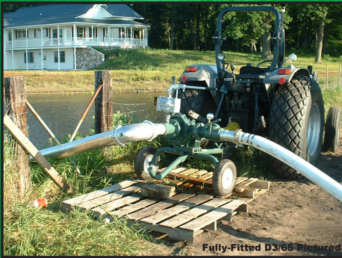
Fully-Fitted D3/65 Pictured